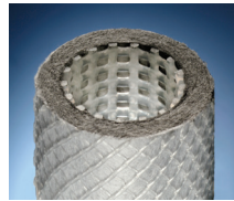
Media type AU

This coalescing element is made with our special UNI-CAST construction. Composed of an epoxy saturated, borosilicate glass micro-fiber media, this media is used in applications requiring the removal of liquid and particulate contamination. This filter media in our standard grade 6 is 99.97% efficient at 0.01 micron.